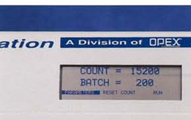
Job running/batching status.