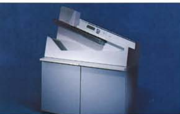
Closed view of Model 206.

* Tyvek is a registered trademark of Dupont Corporation